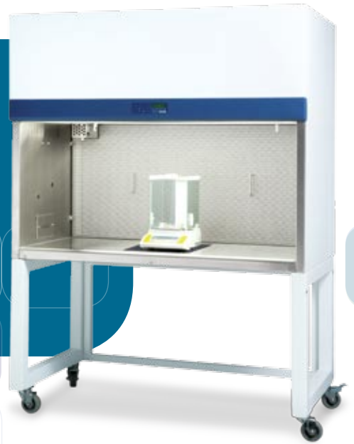
Labculture Reverse Horizontal Flow Cabinet Model RHL-4A. Shown with optional support stand.